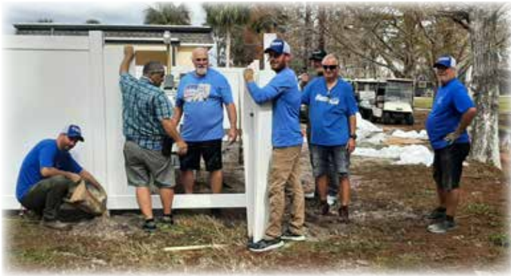
(Maintenance Staff & Men's Club members putting up new fence around PH 2 Pool Pump House)

As the season is in full swing, please ensure you are following the rules and regulations at the pool and common areas.