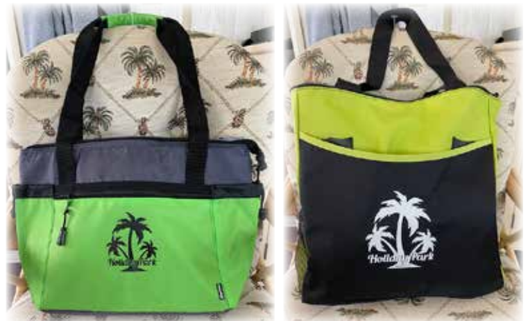
Koozie Cooler Bag $20

For more information or to purchase, contact Linda Gibson at 315-532-2741