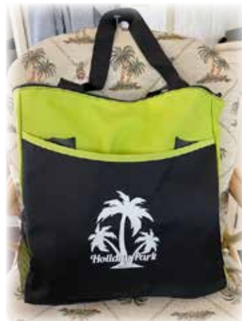
2-Tone Tote Bag $15