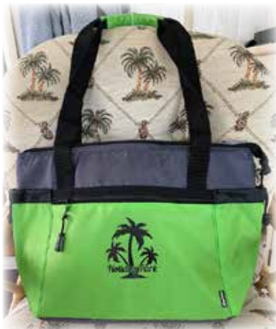
Koozie Cooler Bag $20

For more information or to purchase, contact Linda Gibson at 315-532-2741